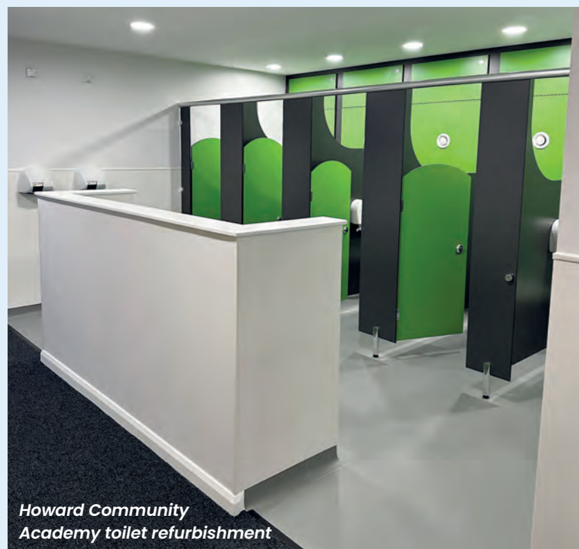
Howard Community Academy toilet refurbishment