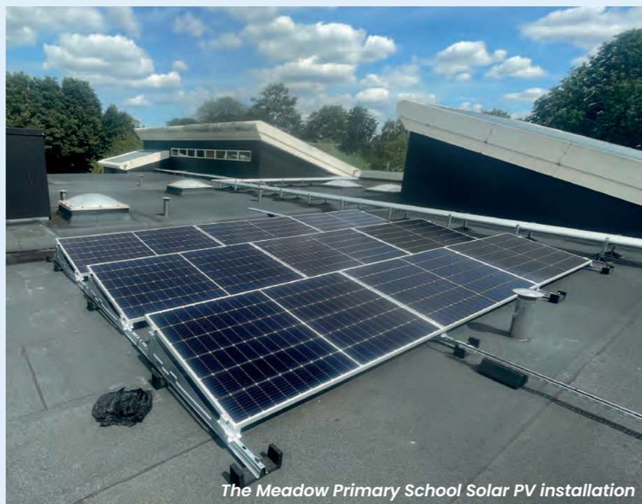
The Meadow Primary School Solar PV installation