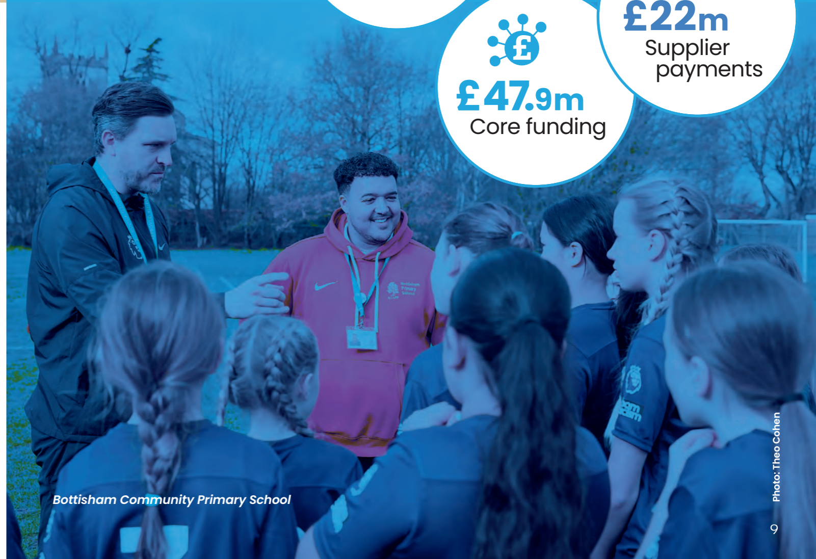
Bottisham Community Primary School