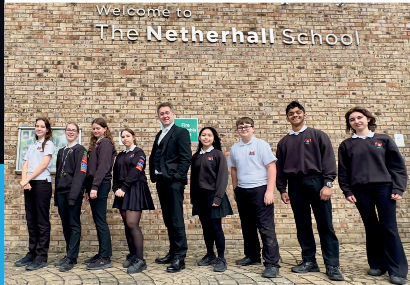
Details of the Annual Report are accurate at the time and date of publication