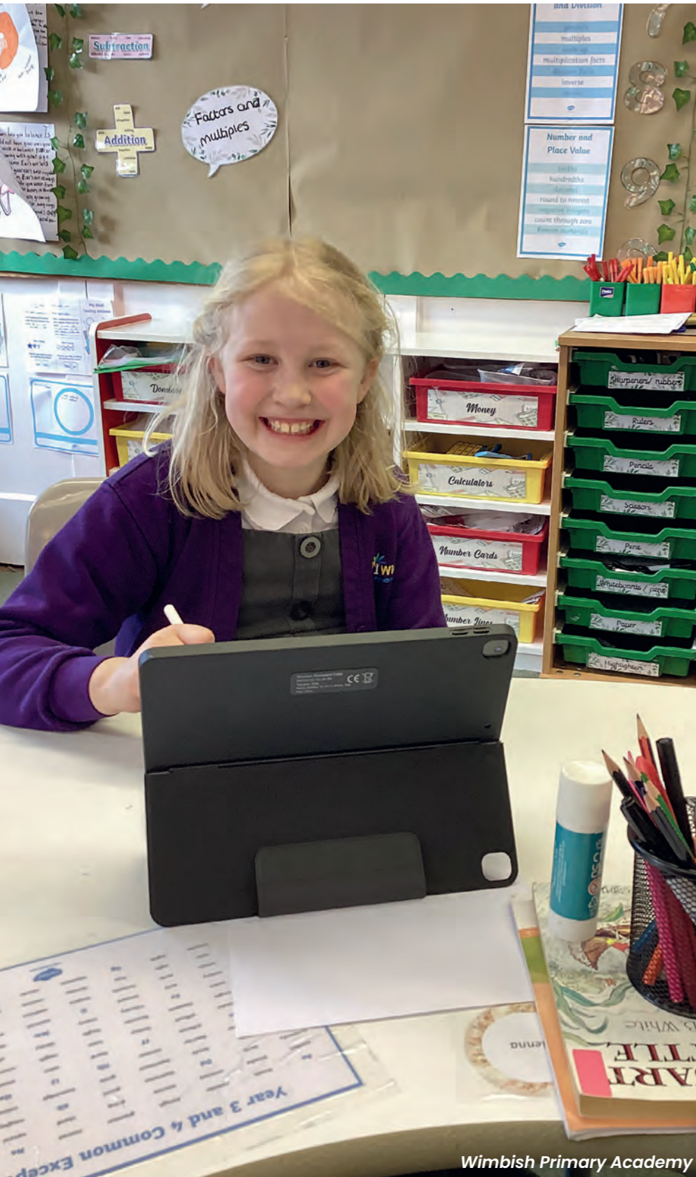
Wimbish Primary Academy

The 2023–24 academic year has continued to be a period of growth and development for primary education within Anglian Learning. As a Trust, we continue to foster a collaborative environment that enhances the educational experiences of our pupils.