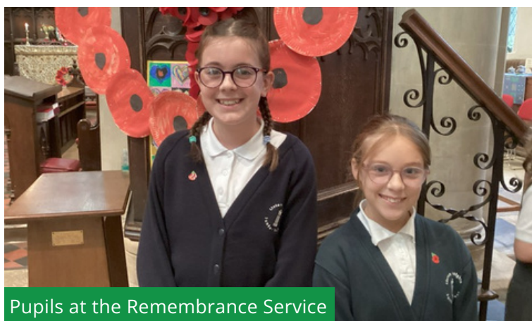
Pupils at the Remembrance Service