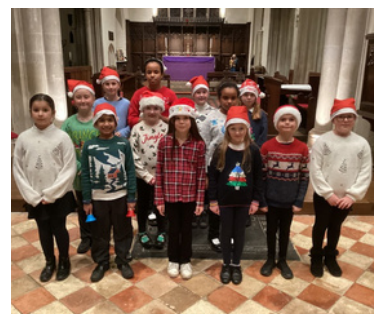
Above: Children from Linton Heights Junior School Choir. The choir joined Cambridge Chorale for a Christmas performance.